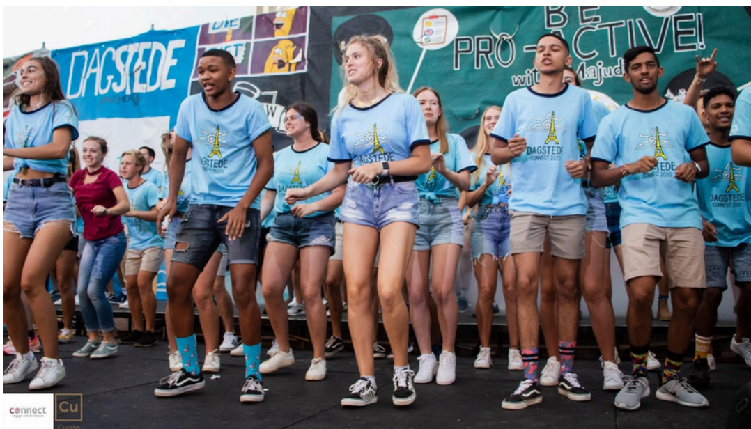
Dagstede 2020 (Dagbreek & Heemstede)