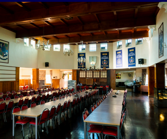
Dining hall where meals can be booked.

*If you are buying appliances perhaps wait until you meet your roommate so you can determine who has what and whether you can share certain appliances.